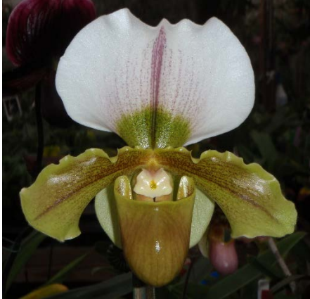
• spicerianum x Stone Lovely