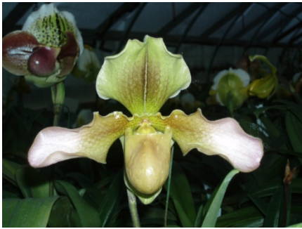
• Topsy Turvy